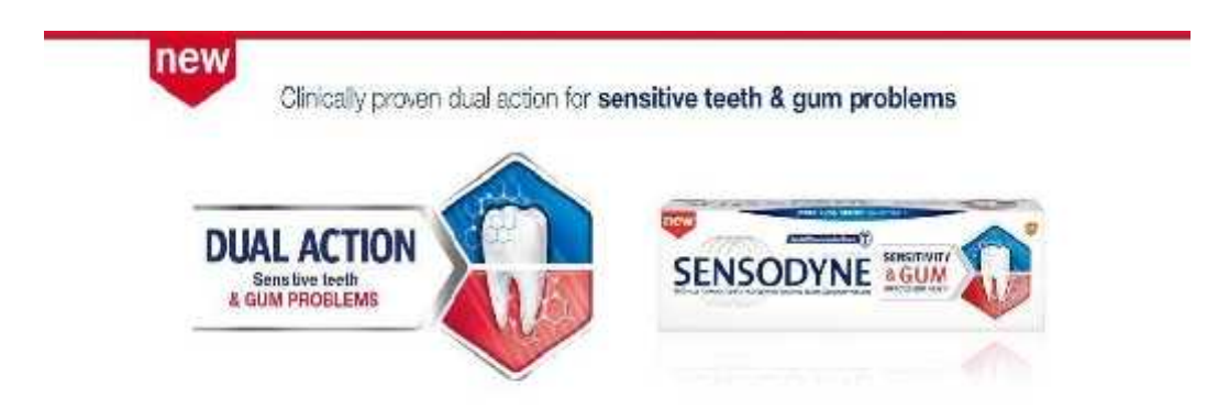
Figure 3. Sensodyne (GSK group of companies, 2017)