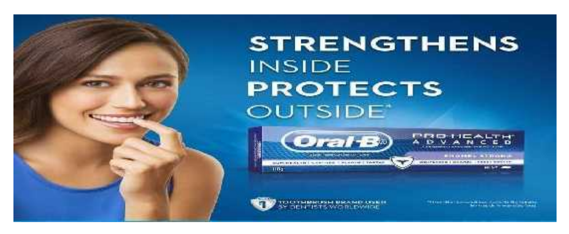
Figure 6. Oral-b (Procter and Gamble, 2019)