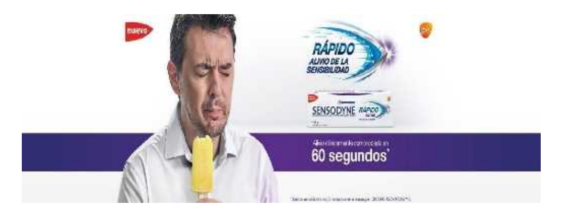
Figure 7. Sensodyne (GSK, 2019)