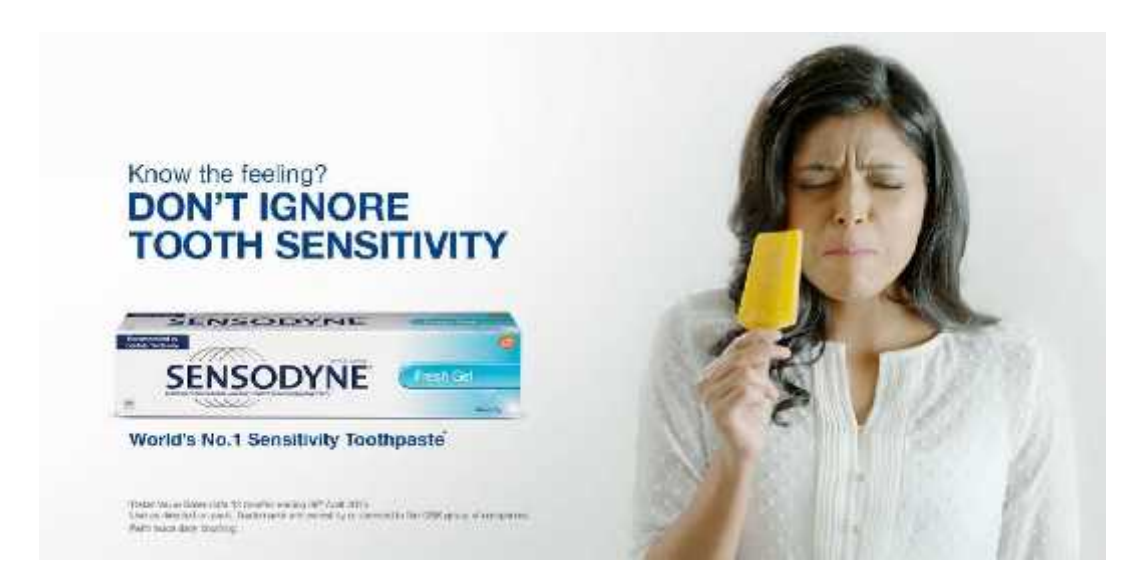
Figure 1. Sensodyne (AdAge India Bureau, 2017, p. xx)