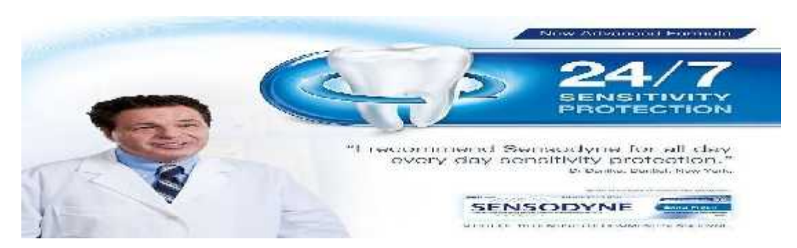
Figure 9. Sensodyne (Braulio Carollo, 2017)