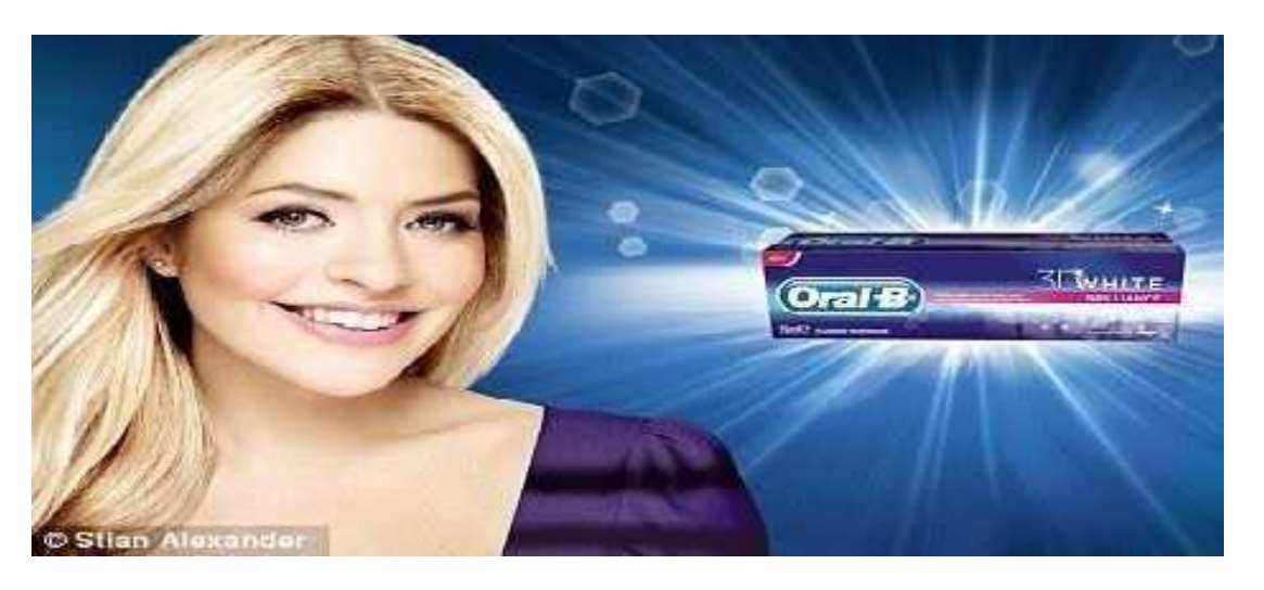
Figure 4. Oral-b (Poulter, 2012, p. xx)