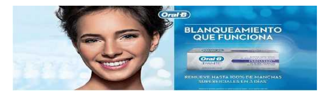
Figure 8. Oral-b (Procter and Gamble, 2019)