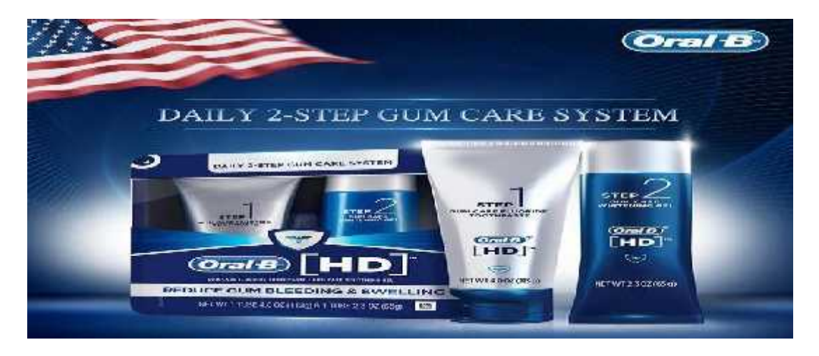
Figure 10. Oral-b (Joybuy, 2019)