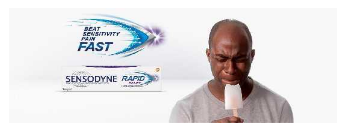
Figure 5. Sensodyne (Gsk group of companies, 2017)