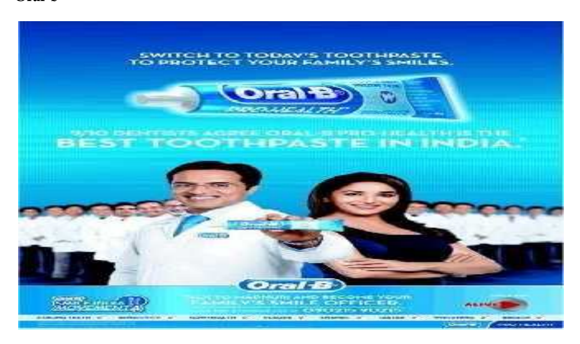
Figure 2. Oral-b (Afaq news bureau, 2014, p. xx)