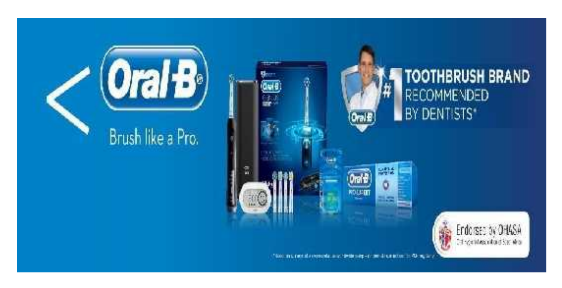
Figure 12. Oral-b (Clicks, 2019)