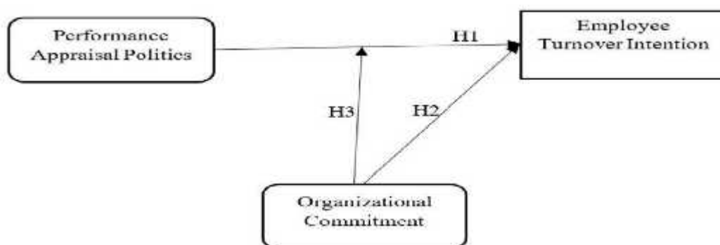
Figure 1 Research framework